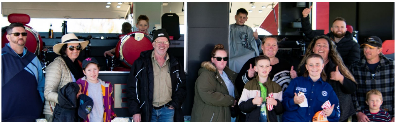
Picture: Happy customers outside Tristan's Mobile Barber Shop.

In conjunction with the Bash, Baptist Care Aged Services used the new Wellness Centre at 64 Queen Street to share information about services and support for older members of the community.