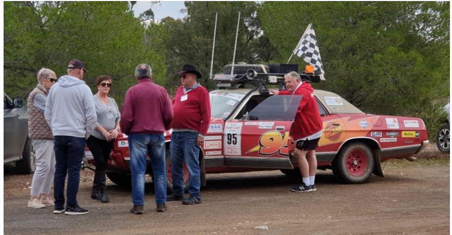
Picture: Orange Cruising Car Club enthusiasts outside the Barmedman Mineral Pool.

Each car sporting John Davis Motors advertising earned a $500.00 donation from the Motor Group. The members also purchased about $100.00 in mosquito repellent from the Barmedman General Store for the auction.