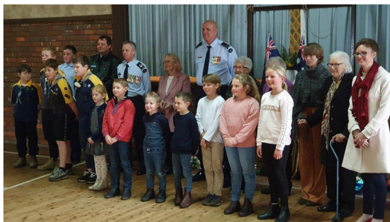
Our children – our future. Pictured with VIP guests